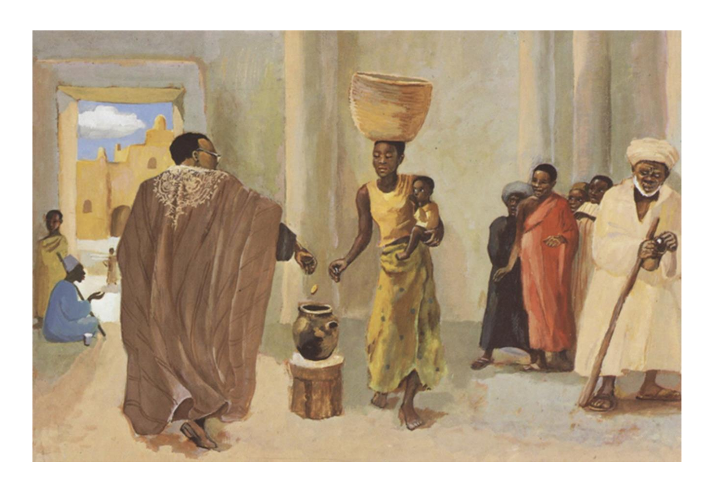
The Widow's Mite JESUS MAFA